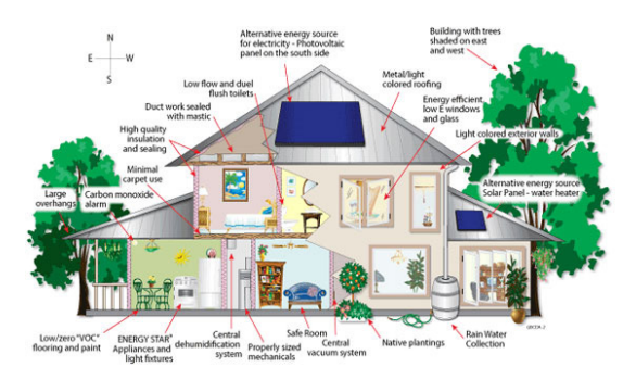
Fig. 2. A typical Example of Green Building.

Globally buildings are responsible for a huge share of consumption of energy, electricity, water and materials. The building sector has the greatest potential to deliver significant cuts in emissions at little or no cost. Buildings account for 18% of global emissions today, or the equivalent of 9 billion tonnes of CO_2 annually. If new technologies in construction are not adopted during this time of rapid growth, emissions could double by 2050, according to the United Nations Environment Program.