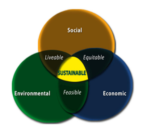
Fig. 1. Importance of Sustainability.

Individual buildings in a development need to be made sustainable as far as possible keeping in mind the economic feasibility of the development. Sustainability at a development level can be achieved